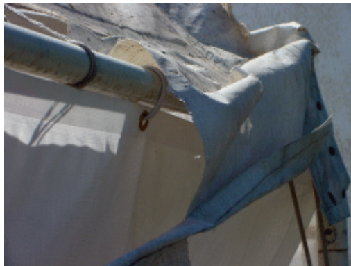
Replacement time at the Shields’ shelter

If your rock equipment is located under a Costco “special” 10X20’ shelter (like us), then you are probably also looking for replacement fabric.