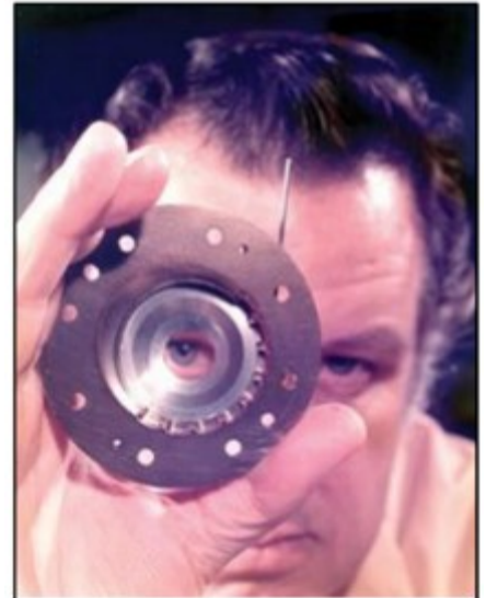
Diamond window from the Pioneer Venus Mission spacecraft.