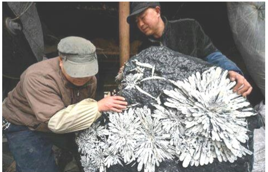
Amazing piece of Chrysanthemum Stone from Liuyang in Hunan Province, China. From Joca Alexandru > Classic Agates and Jaspers via Rockhound Connection

Glaze: 2 cups confectioner's sugar, juice of 2 lemons, (1/3 cup), grated rind of 1 lemon. Mix well. Prick cake, smooth on glaze. (Save extra glaze for graham cracker sandwiches!!)