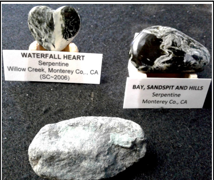
Samples of Serpentine from the Big Sur Area—south coast of Monterey County, California.

Serpentine comes in different forms, depending (perhaps) on the amount of metamorphism it underwent, and the earth materials that helped form it. See examples from Monterey County below.