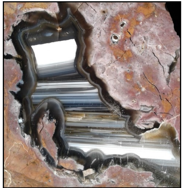
Probably one of my favorite Thundereggs from Oregon has waterlines displaying "tilt" —rotation during formation.

Succor Creek Canyon —Malheur Co.. Thundereggs, Jasper, Agate, Leaf Fossils, Petrified Wood —