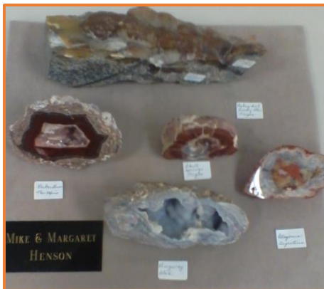
DISPLAYS FROM OUR SEPTEMBER MEETING

Amazingly, VGMS will ALSO host their own show with their wonderful plant sales and silent auctions on March 4-5, 2017. Also at the Ventura Fairgrounds.