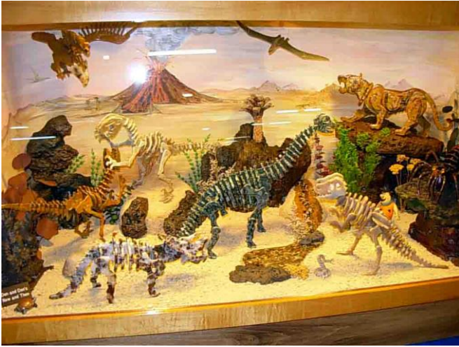
The Peoples Choice Award case