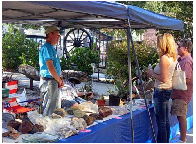
The silent auction table

Store had a dozen small glass bowls really nifty for sphere stands. The price was only $1.00 and I couldn’t let that go by. I took a few pictures and headed home.