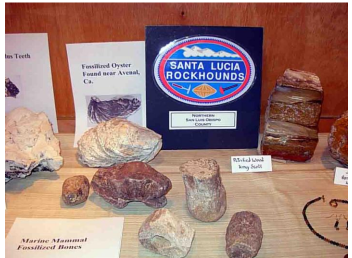
A nice fossil case