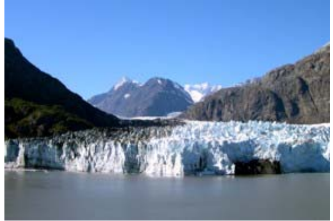
A calving glacier in Glacier Bay (from a safe distance)

awesome glaciers, and what were left of others. It was clear, cold, and beautiful. We heard the sound of thunder, but did not see the calving. "Calving" is the thunderous phenomenon that occurs when salt water melts the glacier's snout, and huge pieces of ice crack off the face.