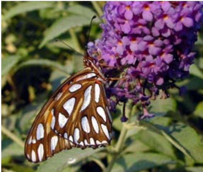
Fresh adult Gulf Fritillary underside

The little critters start out as spiny, black caterpillars with brownish-red stripes along each side. The passionflowers growing in Wes and Jeannie Lingerfelt's next-door neighbor's yard was the food of choice for these little eating machines. Ralph explained that "the neighbor's yard had thousands of the little bottomless pits", so Ralph brought us a dozen to raise.