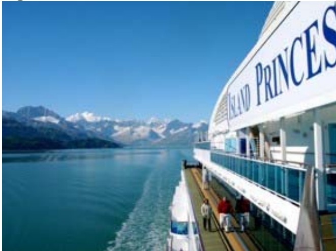
Island Princess sailing north through the inland passage

We finally arrived at the Island Princess (our ship) at 5:15 PM, and the ship was scheduled to start the cruise at 5:30 PM. Plenty of time! Right?