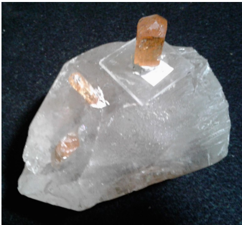
Imperial Topaz in and on Quartz from Minas Gerais Brazil, collected in 2009

November is a special month to me because it is MY birth month. Thanksgiving, autumn leaves, and all that. The two stones associated with this month are yellow to red-orange topaz , and another yellow-colored stone, citrine . Both of these sunshine-colored stones are known for their calming energies, and bring warmth and fortune to those who wear them (according to the American Gem Society). Though topaz comes in several colors, the yellow and red-orange (Imperial) forms are the ones associated with November births. Interestingly, both Texas (where non-commercial quantities of blue topaz have been found) and Utah (think Topaz mountain near Delta), have named Topaz their state gemstone.