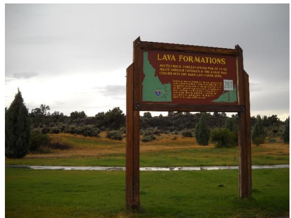
Monument to lava (basalt) fields outside Pocatello, Idaho

After paying homage at both places, I headed back to Miles City, Montana for the night of August 4th, then to Pocatello, Idaho for the night of the 5 th .