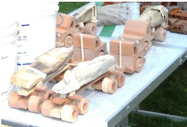
Petrified wood logging trucks--one of my favorite auction items

The live auction that would raise money to help the Federation defray expenses incurred during the field trip, started at 4 pm on Sunday August 3. Many of the 200 or so folks who attended the trip donated prizes to the auction. My donation was a chunk of Turtle Jade from Clear Creek.