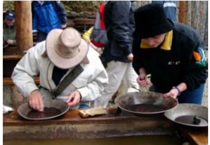
Successful (modern) gold panning requires patience!

The next morning, due to the snowfall, most of the tours were cancelled. The sun was partially out, and the snow was beautiful and unblemished. I was glad I had my gloves, hat and boots since it was rather cold. We didn't see too much in the way of wildlife except for one bear, and two cubs. We did see a male hiker in the distance, and were concerned for his safety as I'm sure he was not aware of the bear.