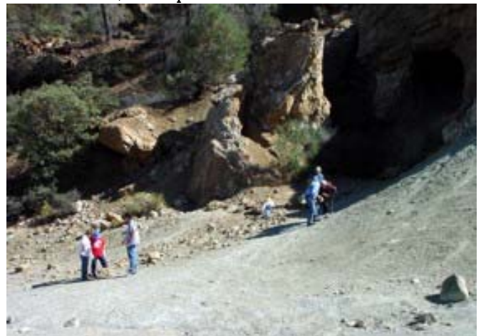
OMS at the Aurora Mine searching for plasma agate

Once the caravan arrived at Clear Creek/Oak Flats Campground, Dick handed out maps of the area he had downloaded from the internet. Next year we will get copies of the BLM map beforehand since we only had one copy from the 11/03 trip.