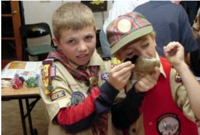
Scouts learning how to use a loupe