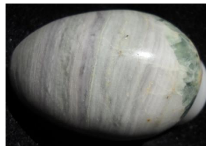
Color zoned fluorite from near Austin, Lander Co., Nevada (SC)

Color Zones in fluorite are created when there are differences in the chemical environment as the fluorite formed over thousands and millions of years. Sometimes the changes go back and forth, back and forth and create zones that look like layers.