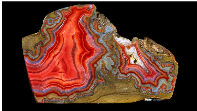
Manville Agate Niobrara Co., Wyoming (marine sedimentary origin). From Sedimentary & Vein Agates by Heart of Wisconsin Gm and Mineral Society

A notably different source of agates are the amygdules that form in gas bubbles in volcanic rock. Nipomo Sagenite and Marcasite are examples of this kind of agate. Amygduloidal agate differs from Sedimentary agate by the presence of eyes, tubes, sagenite, moss, shadow banding, and often finer banding than found in Sedimentary Agate. The silica in these agates is primarily dissolved volcanic ash.