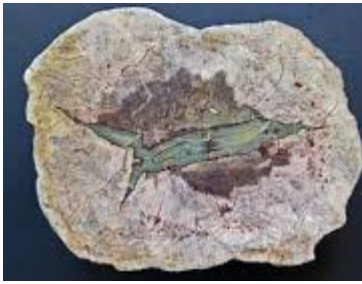
Thunderbird Park thunderegg.

We would leave early the next day for Glen Innes and the National GemBoree.