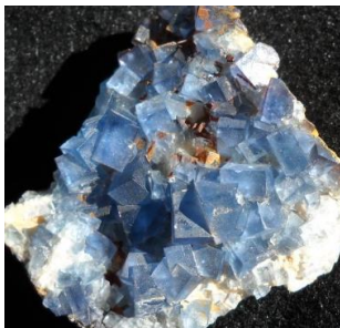
Bright blue fluorite from the Bingham Mine, Socorro County, New Mexico, USA.

Light blue in fluorite can be created when the rare element yttrium (Y) takes the place of some of the calcium (Ca) atoms.