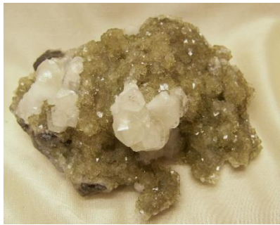
Yellow fluorite and calcite from Villabona, Asturias, Spain (Collection of Barbara Bilyeu)

Yellow in fluorite is also created by special chemical changes inside the crystal. Yellow fluorite forms when two fluorine ions (F) are replaced by one oxygen (O) ion.