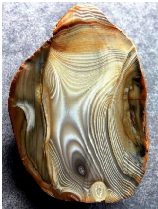
Australian Ribbonstone (a banded chert from Queensland, Australia)

This show did not have anything except cases of competition stones and minerals. Marcia only had lapidary pieces, including an old car done in petrified wood from the Chinchilla area of Australia, a double 1370 Saw Leaf Court #5-faced rainbow obsidian (in the rough) Emmett had given her, a specimen of Ribbonstone, and several other pieces in different categories—cabs, freeform, etc.