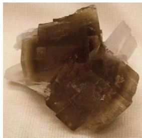
Brown fluorite cubes from Clay Center, Ohio, USA (Collection of Barbara Bilyeu)

Brown in fluorite is created by impurities of hydrocarbon material like oil or tar that are trapped in the fluorite crystal structure. "Hydrocarbons" are materials that were created by decaying plants that were trapped in sediments. Later, when the sediments became rock, the plant material broke down (decayed) into large molecules made up of hydrogen and carbon.