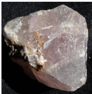
Pink bipyramidal fluorite crystal from unknown location

Pink and red in fluorite is created by a very complicated chemical change in the fluorite that involves the elements yttrium (Y) and oxygen (O). We'll leave the details to the experts, but it is fun for you to learn that small changes inside a fluorite crystal can create very different colors.