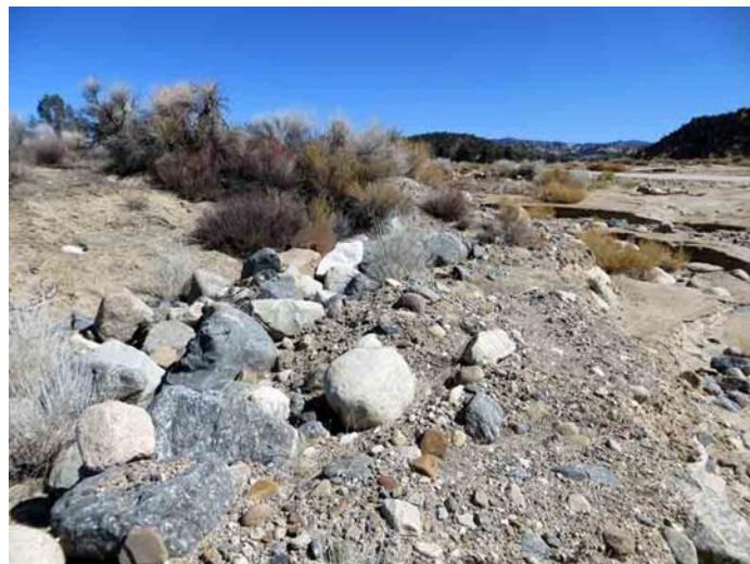
Andesite Granite and other rocks in Reyes Creek