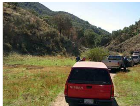
Figure 3 the Meadow

As the day grew warmer it was decided to try to circle around over the mountain and come out near the entrance to the ranch on our way to the final stop of the huge rock pile there.