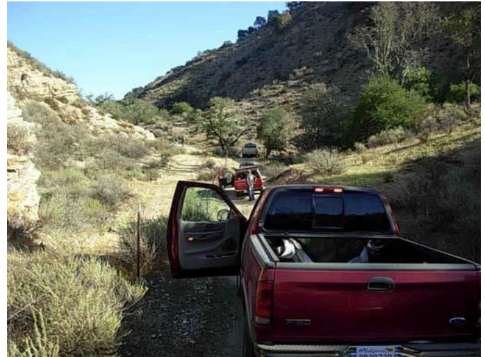
Figure 2 Rugged Canyon Trail

arrived at the picnic area hungry for breakfast and enjoyed the process of cooking eggs for burritos in a quart-sized zip lock bag placed into a tub of boiling water. Bob indicated that the cooking should take about 12 minutes however; I learned that applied to a bag with no meat in it. It seems the extra material placed in the bag greatly increases the cooking time. We finished a great breakfast and cleaned up the area before heading out into the narrow canyons to look for fossil Concretions.