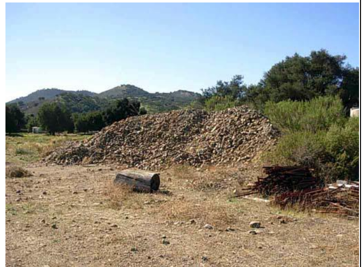
Figure 6 the Rock Pile

At the rock pile we dug through the pile looking for some more of the rock I found last visit there. No luck this time. I did find a few small rocks that looked close to the green orbicular rock but there isn't the same amount of silica in these. I'll know more after I cut them; who knows perhaps they will turn out to be useful.