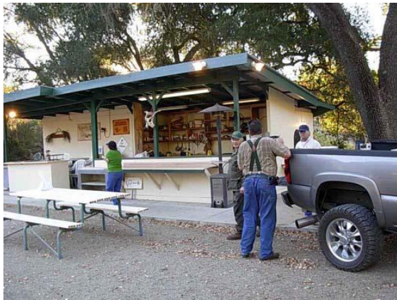
Figure 1 Ranch Picnic Facility

East of Santa Maria, CA on Hiway 166 lays a secluded Ranch nestled in the mountains of Oak trees and dry washes. It's called Porter Ranch and it lies among the hills of Miocene shale from the Monterey Formation. Due to recent rain the hills were showing lots of green and the temperature was beginning to warm up to a pleasant 70 degrees. Our fieldtrip leader is a friend of the ranch owner so he was able to schedule a visit for the day beginning with breakfast at the ranch picnic area. This is no ordinary facility as it has a generator for electricity and gas stoves for cooking. I have been there twice now and it is a real pleasure to be able to enjoy this primitive yet ultra-modern facility.