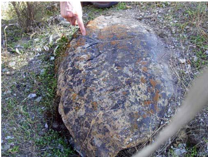
Figure 4 Sylvia's Sea Turtle

We made it back down and decided to search the meadow area. We discovered several concretions and Sylvia Nasholm discovered a huge fossil sea turtle on the eastern edge of the meadow. Ralph discovered a huge concretion of at least 600 pounds he believed contained a whole Seal. Having searched the meadow thoroughly we then decided to visit the large rock pile near the ranch entrance.