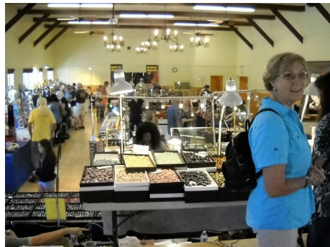
View from the stage

More pictures can be found on Kim Noyes’ Blog Eclectic Arcana