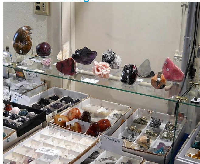
There were some real nice minerals and fossils at this show