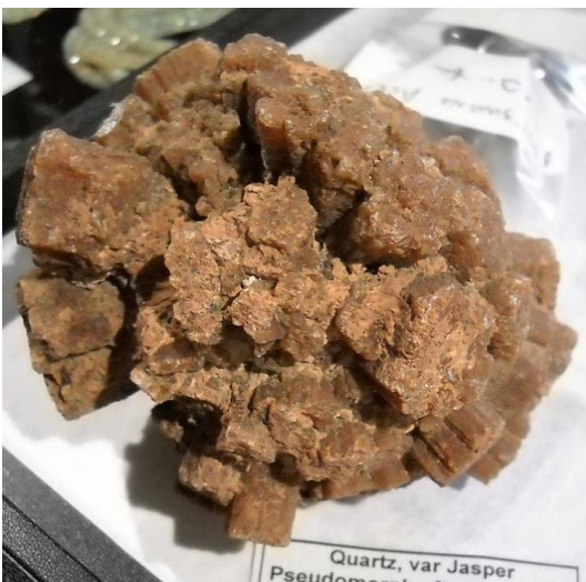
Aragonite replaced by jasper!! From Chubut, Argentina—I could say something, but I won't...