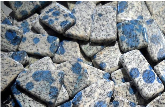
Azurite in granite!! From K-2 (second highest mountain in the World) in Pakistan ($1.00/Gram)