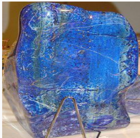
A polished specimen of lapis lazuli.