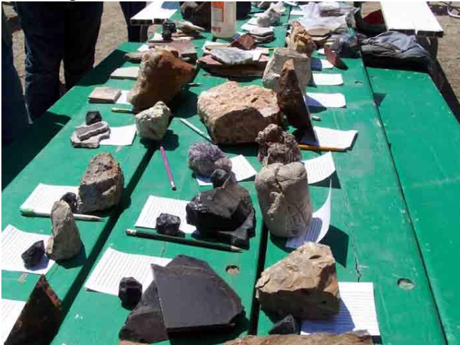
Some of the "goodies" in the Silent Auction.

as well a spirited silent auction that made $64.50 for our general fund.