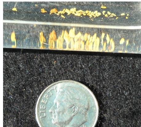
Gold panned from $45 commercially purchased bag. Probably less than 1/31 Troy ounce (one gram). Author's collection