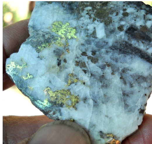
Gold in matrix (location unknown) from author's collection

A local group Central Coast Gold Prospectors continues the passion of searching for gold wherever it occurs.