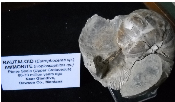
Fossil from Terry, Montana AFMS Field Trip, August 2014