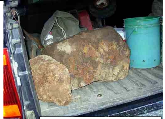
Huge Boulder in Wes's Truck!

On Thursday morning Jeannie and I loaded into the SUV and journeyed up to SEE Canyon just north of Avila Bay. The road is a 13-mile loop-T-loop road that appears too narrow for two cars to pass each other. About 7 miles up the road it becomes a dirt road for about a ¼ mile. Lots of Apple farms dot the landscape in the canyon. As we entered the dirt track I turned to Jeannie and asked, "Does this look familiar?" "Not really", she said. I slowed down and tried to see the rocks along the road. I notice signs up on the banks of the road in the trees declaring "No Trespassing" or "POSTED". I also noticed that the banks were covered with Poison Oak. No worries, I thought. We'll just stay in the 60-foot easement on this County road where there isn't any danger from landowners or that itchy stuff.