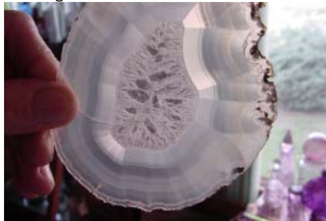
Iris agate specimen with rainbow colors