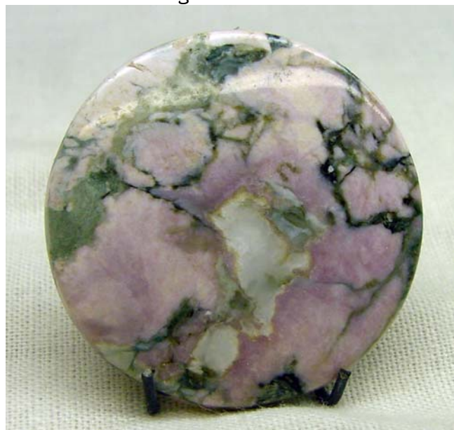
Xonotlite cabochon in Ralph's collection

Ralph knows the hidden nooks and crannies all over central California, where the treasures are buried, and where the best specimens can be located. His museum-like glass cases house some of the specimens Ralph has chosen for his collection (and our viewing pleasure). For example, the round xonotlite cab (below) is one Ralph created from a specimen he collected on trips to an obscure beach near Point Sal. He tells tales of hitching rides with "men in blue" when leaving the area.