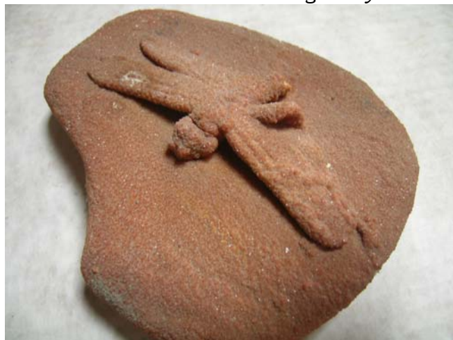
The whole rock (and dragonfly) is covered by the halite crystals