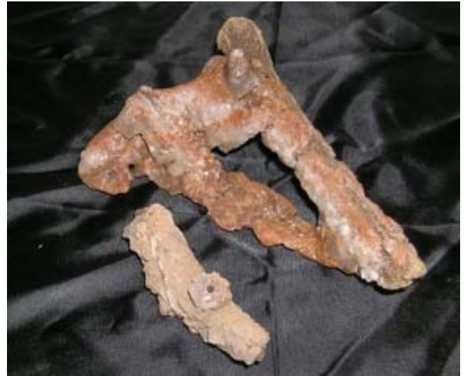
Halite-covered limbs from the Salton Sea in white light

Impurities can also make halite fluorescent. We had high hopes that the dragonfly might fit into that category, but it didn’t. Only the part of the thorax (damaged by the 2003 San Simeon earthquake) showed some response to the UV lamp. Too bad! A glowing dragonfly would be so cool!