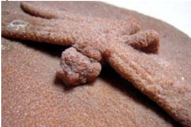
Halite-encrusted dragonfly from the Salton Sea

Halite can harden into a crust on objects submerged in salt-rich water, and in special circumstances, result in a thing of beauty. Witness this well-preserved specimen of a dragon fly from Sherm and Bea Griselle’s collection: