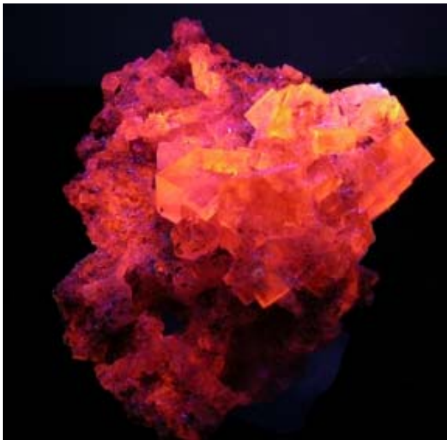
Argentinian halite showing similar red fluorescence

Another specimen of halite in our collection is from Catamarca Province, Argentina, a large mass with 1" crystals. It displays a similar reaction when we shine short wave UV on it.