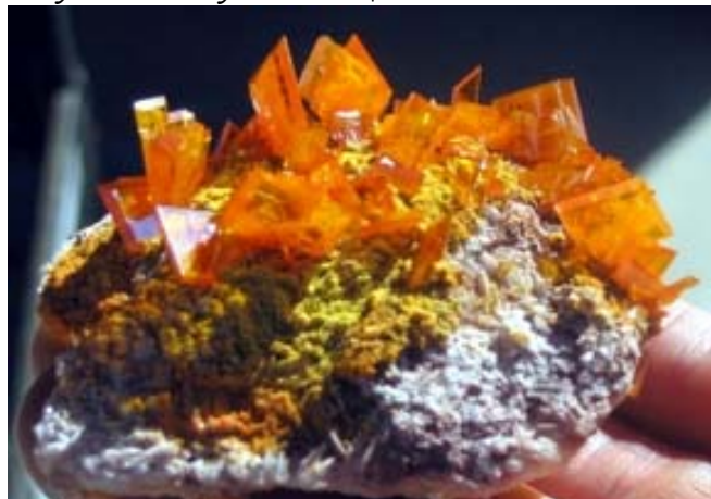
Wulfenite on mimetite and andesite from Rowley Mine