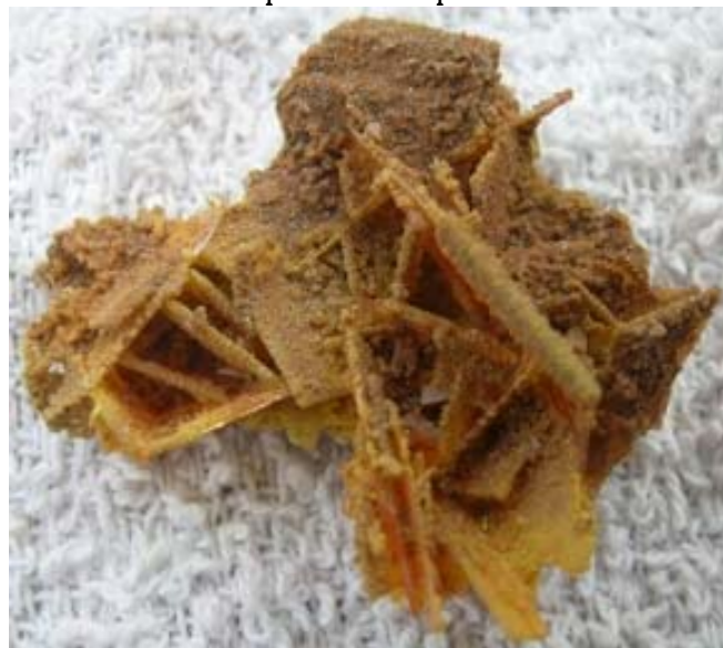
Vanadinite replacing wulfenite from Rowley Mine

We arrived at the mine just as Ed and Bill Jaeger were quitting for the day. Exhausted, covered with red dust, but grinning from ear to ear, proud of their latest discovery – a pocket of vanadinite pseudomorphs after wulfenite! We looked carefully through the microscope and confirmed...true pseudomorphs!