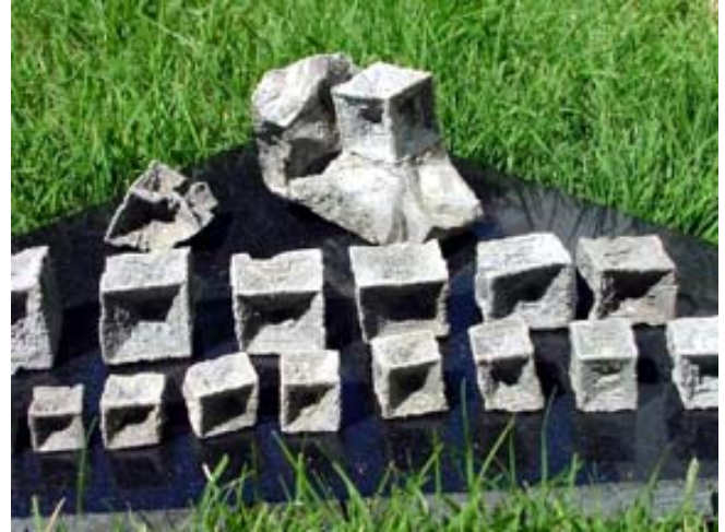
A group of selenite pseudomorphs after halite hoppers from the Santa Maria area

"hopper" crystals. This exciting find is producing crystals up to 3" on a side, and shows the existence of an ancient distilling water body that could produce hoppers. They form as growth crystals floating on the surface of brine water bodies.