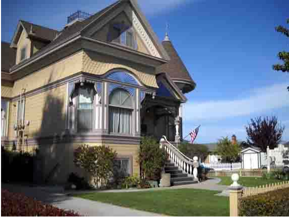
John Steinbeck House, 132 Central Avenue, Salinas

But in searching for a place to detect, we came across the restored John Steinbeck birthplace that I had not seen before. That house was a real Pearl.